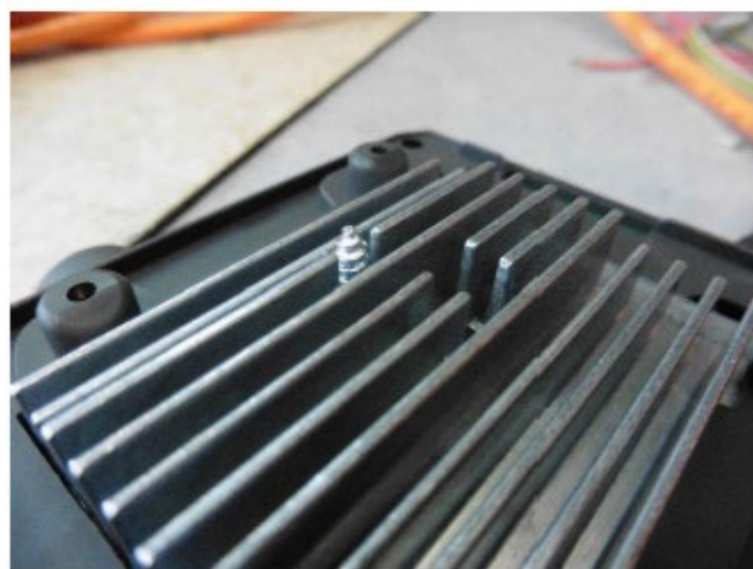
Figure 3: Actual Screw