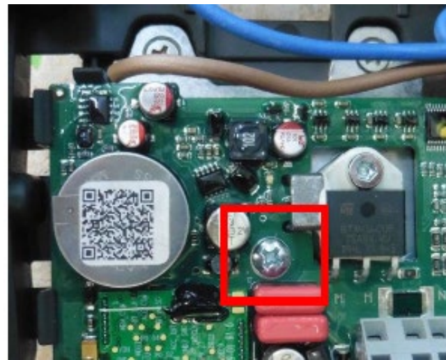
Figure 4: Actual Screw, position on electronics board