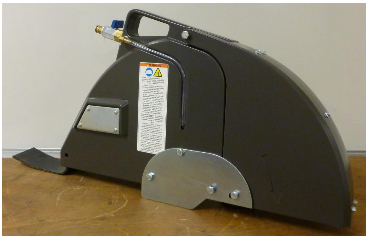
Figure 4: Old cancelled blade guard design. 18" / 450 mm (542 20 23-60) and 20" / 500 mm (542 20 40-89).