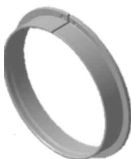
Figure 3. Lock Ring in metal that distinguishes updated DM220 from pre-update machines.

Because of the amount of new parts that have been introduced it is important to control the serial number of the serviced machine to ensure spare parts compatibility. Please see Parts Information for new parts. The easiest way to identify an updated machine is to see if the Lock Ring is made of metal, see Figure 2.